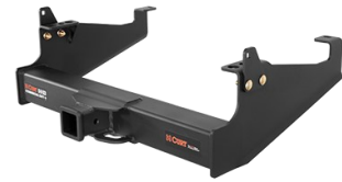
Class 5 Trailer Hitches