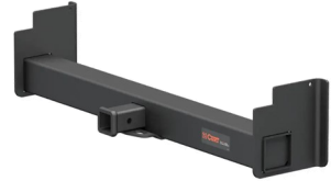
Weld-on Trailer Hitches