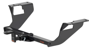
Class 1 & 2 Trailer Hitches