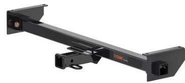
Adjustable RV Hitches