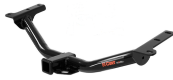
Class 3 & 4 Trailer Hitches