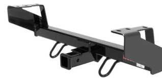
Front Mount Hitches