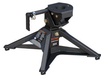
CrossWing 5th Wheels