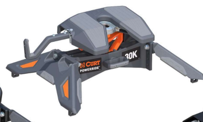
PowerRide 5th Wheels