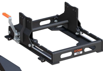
5th Wheel Sliders