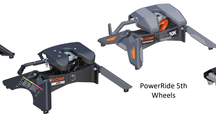
A-Series 5th Wheels